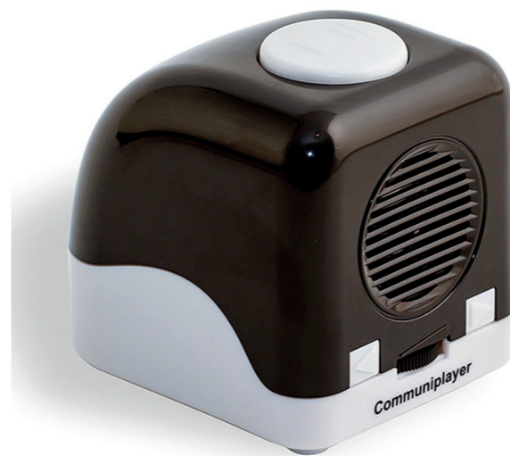
Image shows the RNIB Communiplayer - A memory stick talking book player.

Dance like no one is watching! Catch up on your favourite podcast.