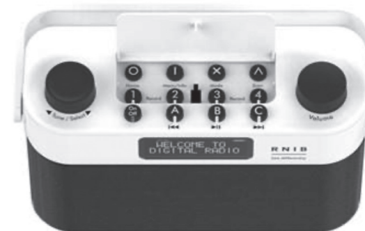
Image shows the HD13 radio

If you decide to stop playing a Talking Book or audio file and unplug your USB