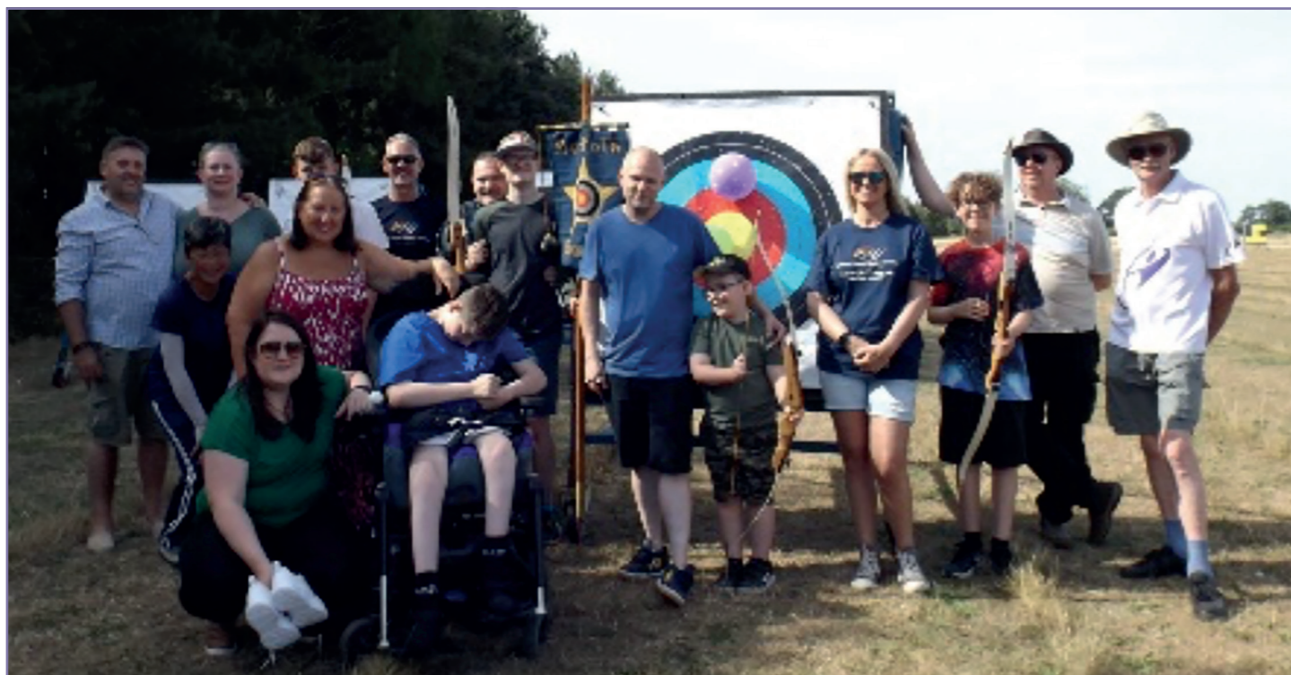
Image shows participants taking part in an archery workshop

The Children, Young People and Families department organises a variety of activities and events to build skills, develop confidence and encourage peer support. By running events that include the entire family, these fun and exciting activities empowers families to bond through these shared experiences.