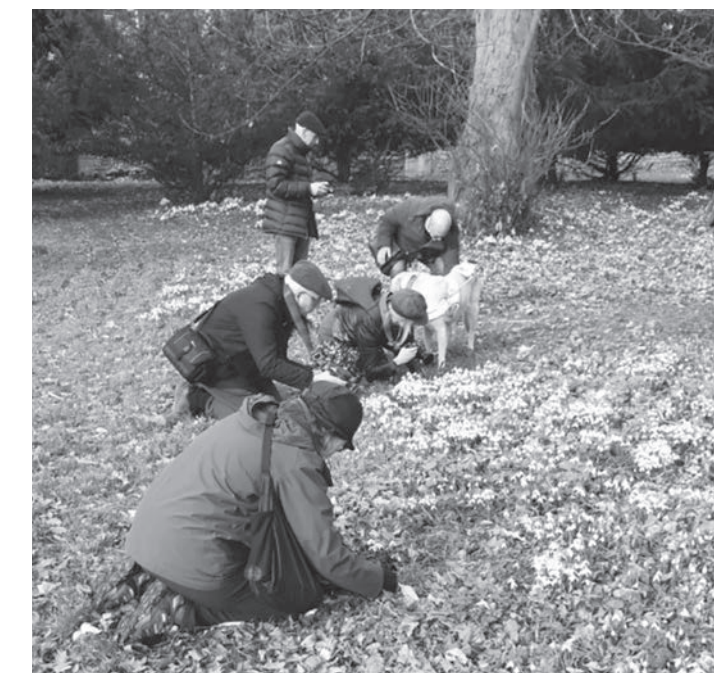
Image: Members of the photography group kneeling on the ground to get close up pictures of small white flowers.

The Effstopeyes is a group of passionate photographers with vision impairment that meet at the Norwich Hub. In the past they've gone hunting snowdrops, held exhibits to display their work and gone on photoshoots in the Norfolk countryside.