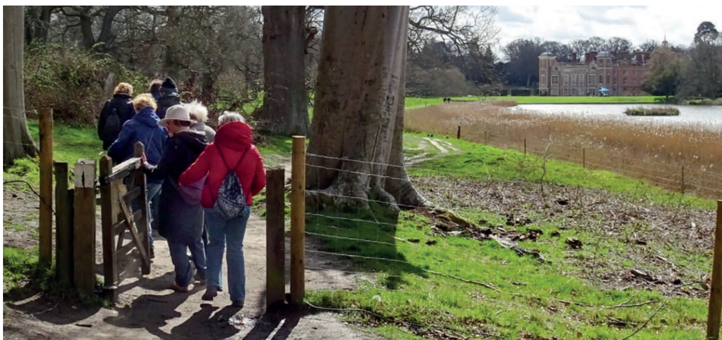
Image: A walking group from behind passing through a gate on the Blickling Estate. There are large trees on either side of the pathway. Blickling Hall is visible in the distance on the right over a body of water.

With the return of the warmer weather we are once again hosting accessible walks and outings in the Norfolk sunshine.