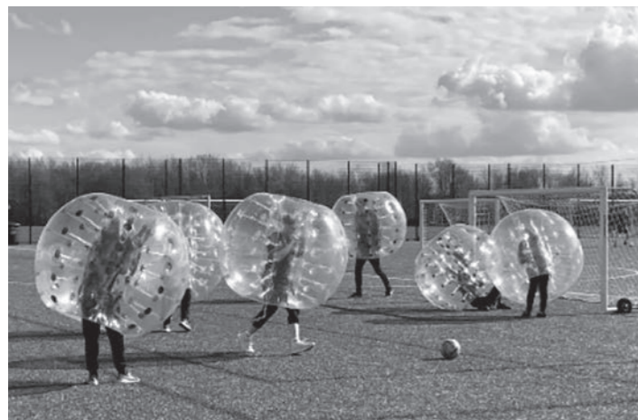
Images: Left – A group inside large inflatable balls playing bubble football. Right - four people in boiler suits and face protection inside Norwich Rage Rooms.

In April, the CYPF department created three new events for Vision Norfolk. These were Gravity Trampoline Park, Norwich Rage Room and Bubble Football. These were great fun and it was wonderful to see both the children and parents enjoying the sessions.