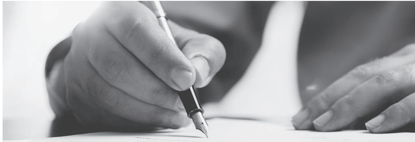
Image: Hand holding fountain pen to piece of paper.