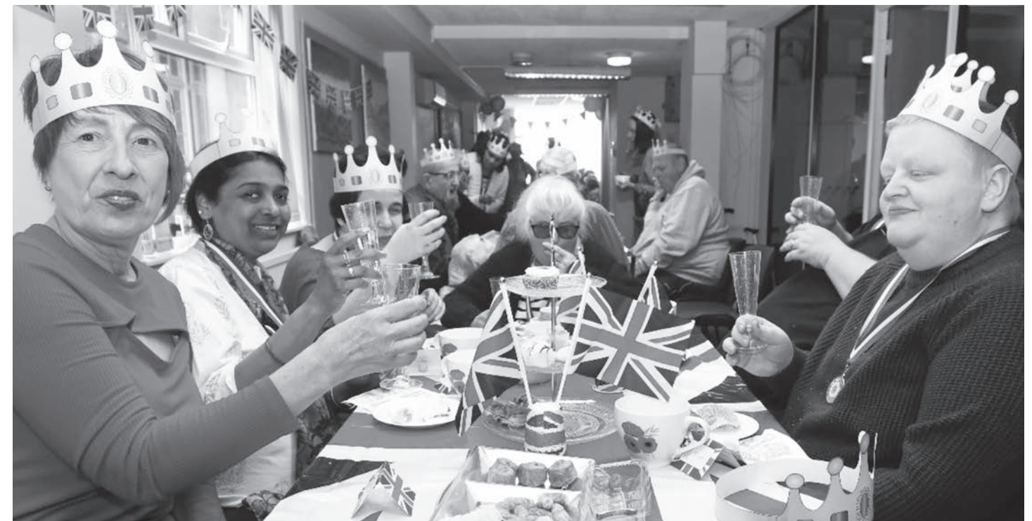
Image: A table of people wearing crowns raise their glasses at the Coronation Tea Party. The table is brightly decorated with Union Flags.

The group enjoyed the atmosphere of the train as they travelled along the nine mile track from Wroxham, before having a special lunch at the Whistlestop Café at Aylsham Station prior to the return journey.