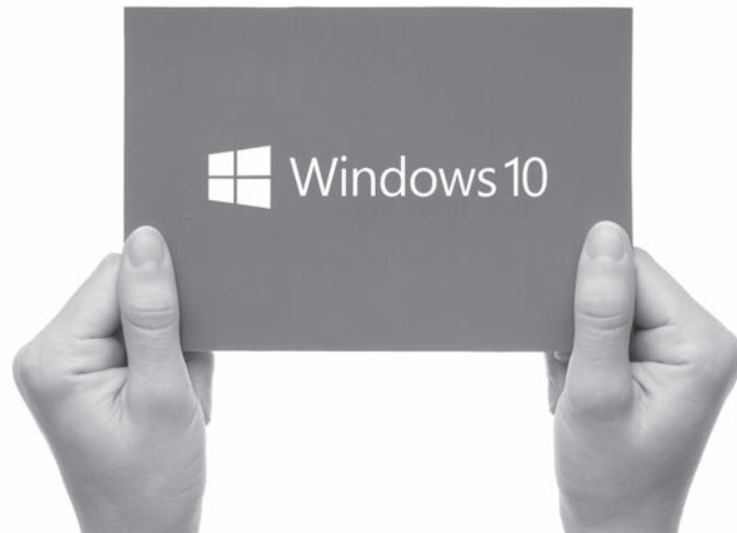
Image: Two hand holding a rectangle with the Windows 10 logo.

We've had quite a few questions in our equipment centres about the accessibility options for Windows 10 computers. Accessibility features can be found by selecting "Settings". You can use the keyboard shortcut which is the Windows key and "i" or go to the lower left corner, click the Windows start icon, select "Settings" and then "Ease of Access".