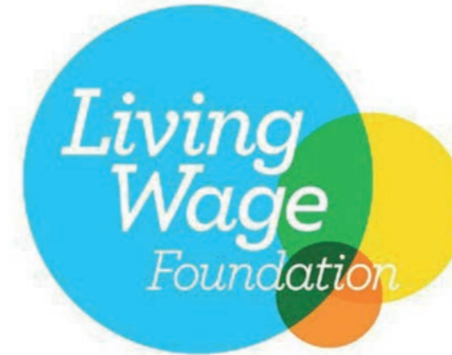
Image: Living Wage Foundation logo consisting of three overlapping circles of blue, yellow, orange.

Vision Norfolk has been accredited as a Real Living Wage Employer.