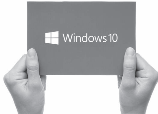
Image: Two hand holding a rectangle with the Windows 10 logo.

We've had quite a few questions in our equipment centres about the accessibility options for Windows 10 computers. Accessibility features can be found by selecting "Settings". You can use the keyboard shortcut which is the Windows key and "i" or go to the lower left corner, click the Windows start icon, select "Settings" and then "Ease of Access".