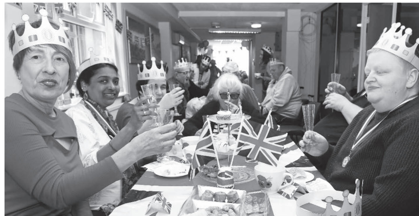
Image: A table of people wearing crowns raise their glasses at the Coronation Tea Party. The table is brightly decorated with Union Flags.

The group enjoyed the atmosphere of the train as they travelled along the nine mile track from Wroxham, before having a special lunch at the Whistlestop Café at Aylsham Station prior to the return journey.