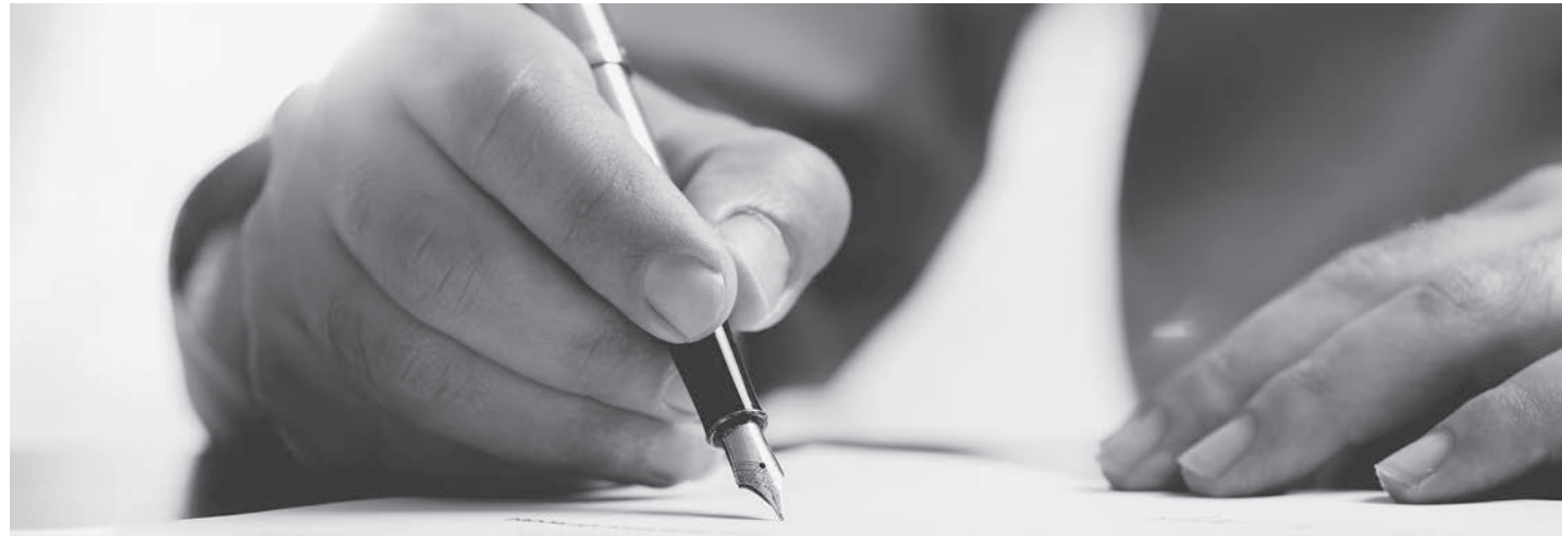
Image: Hand holding fountain pen to piece of paper.