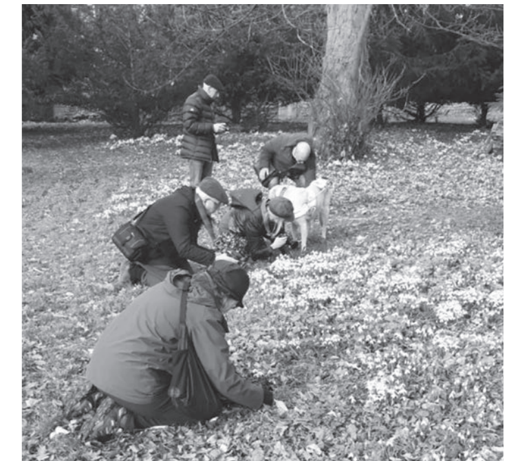
Image: Members of the photography group kneeling on the ground to get close up pictures of small white flowers.

The Effstopeyes is a group of passionate photographers with vision impairment that meet at the Norwich Hub. In the past they've gone hunting snowdrops, held exhibits to display their work and gone on photoshoots in the Norfolk countryside.