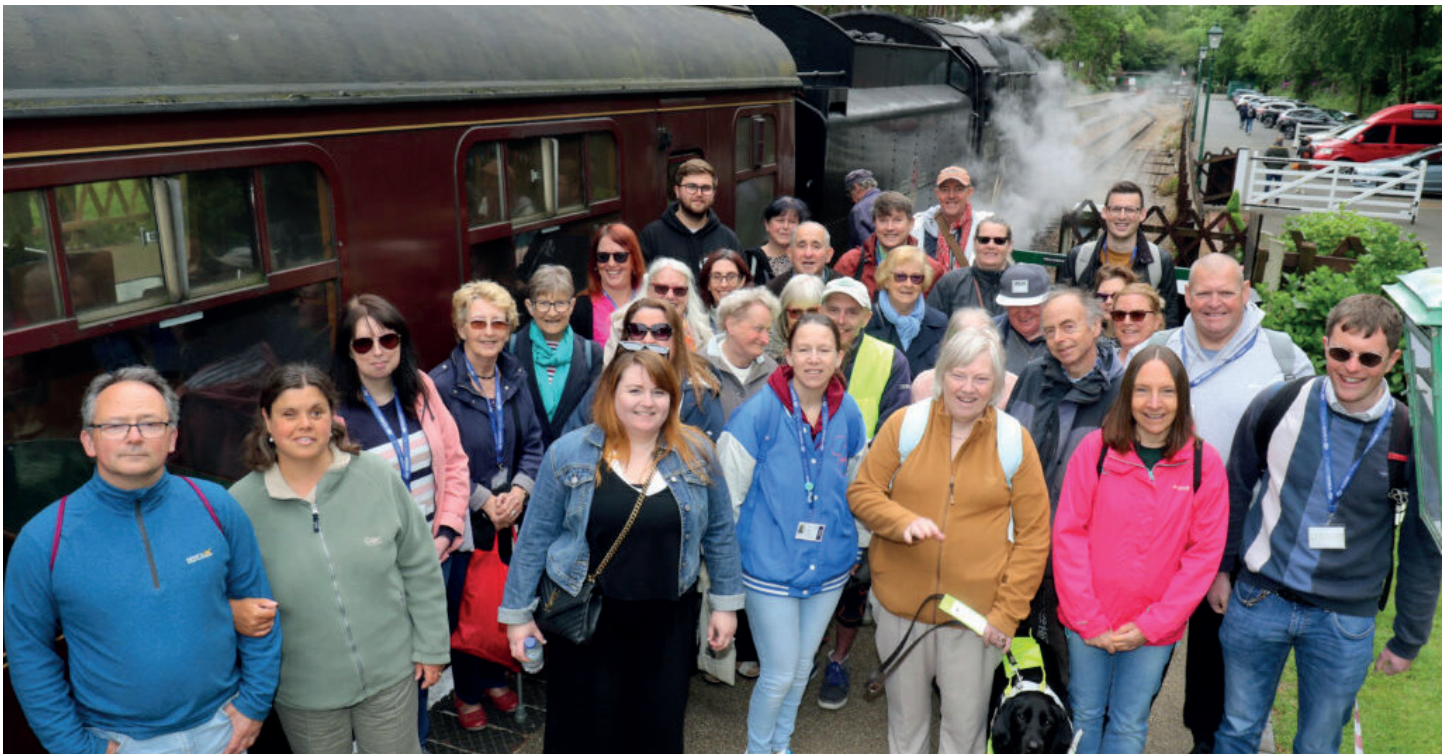
Image: The group of around 30 volunteers and Vision Norfolk staff at the annual volunteer outing. They are standing on the platform in front of a dark red and black steam train smiling at the camera.

Magpie News is currently available by mail in printed, Braille, or audio on a memory stick or CD. A digital format is also available on our website and by email as a Word Document or a PDF.