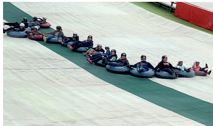
Image: Left - A long chain of 16 children staff and volunteers slide down the slope holding hands. Right - Two children posing with two hosts from the Hippodrome Circus. All four have big smiles and are showing a thumbs up. The hosts are wearing bright formalwear and bowties. They are standing in front of lights, signs and a mirror inside the circus.

In the coming months we would like to continue to reach more families across the county with the focus of running more events in the Great Yarmouth and King's Lynn areas. We are starting a new preschool group for Great Yarmouth