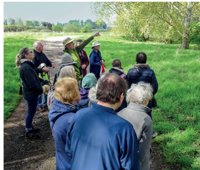
Image: A group of about thirteen people from behind. They are standing on a pathway in a sunny field in Lakenheath Fen. The guide is pointing up towards a nearby collection of trees.

We have been very fortunate this year in that most of our walks have been educational as well. An early morning stroll through RSPB Nature Reserve Lakenheath Fen to listen to the bird song resulted in us hearing 53 different types of birds singing their hearts out. We know this because our guide from the British Trust for Ornithology listed them all for us. Thank you to the Brecks Council for organising our visit.