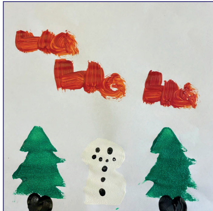
Image: A snowman and two evergreen trees painted on white paper. At the top of the image "ho ho ho" is written in red paint.