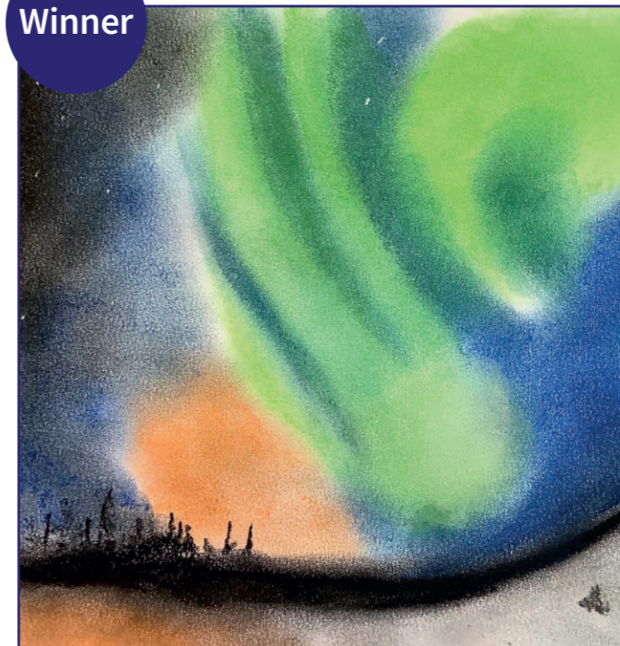
Image: Drawing of the green, blue and orange Northern Lights behind the black outline of trees.