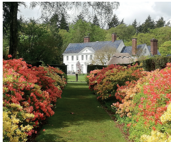
Image: A straight grass pathway lined with pink and yellow flowers ending at the large white building that is Stody Lodge.

The colourful and scented gardens were a spectacular feast for the senses and along with the lovely sunshine and tasty homemade ice creams made it a memorable day.