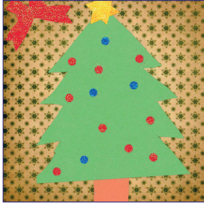
Image: A Christmas tree with red and blue sparkly ornaments and a sparkly star on brown patterned paper. There is a sparkly red bow in the top left corner.