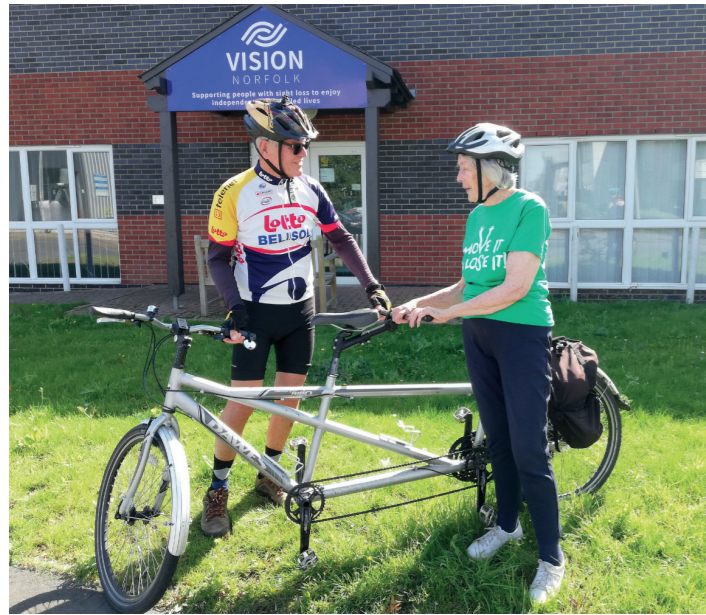
Image: A man and a woman standing next to a tandem bicycle in front of the King's Lynn Hub.