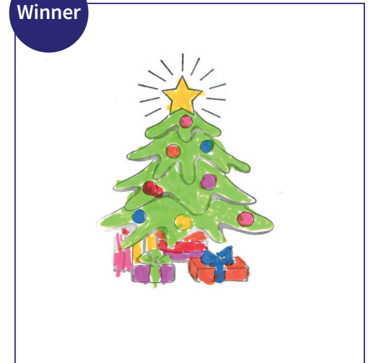
Image: Stamped outline of a decorated Christmas tree with presents and a star on top. Coloured in with felt tip pens in bright green, yellow, pink, orange, red, purple and blue.