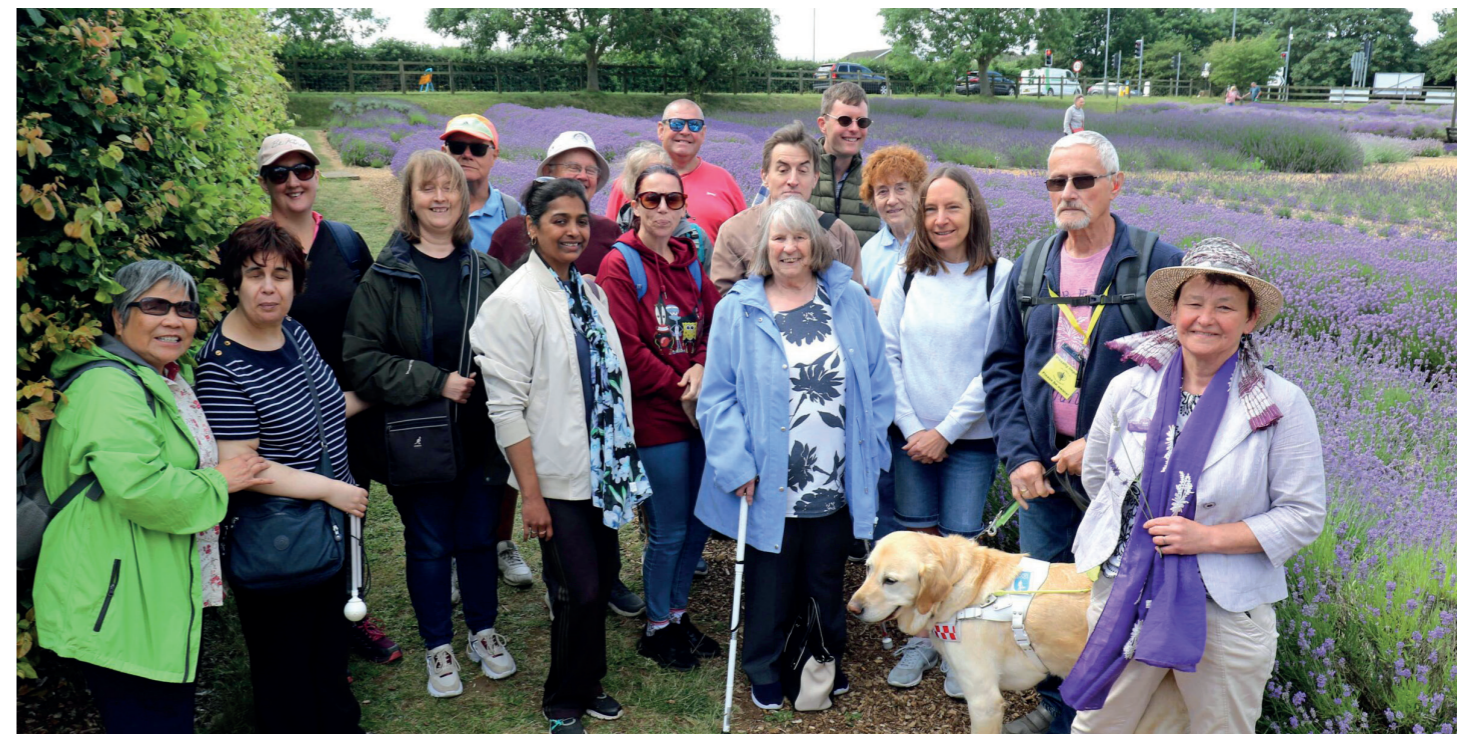
Image: A group of 17 participants, volunteers and staff members, as well as one guide dog, standing outside at the Norfolk Lavender Farm. The group is smiling at the camera and there are fields of lavender in the background.

Find more information on our upcoming activities later in this newsletter or by getting in contact.