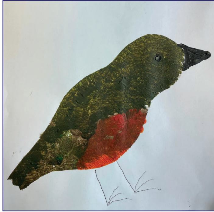
Image: Brown and red robin painted on white paper. It has a black beak and eye and legs drawn on with pen.